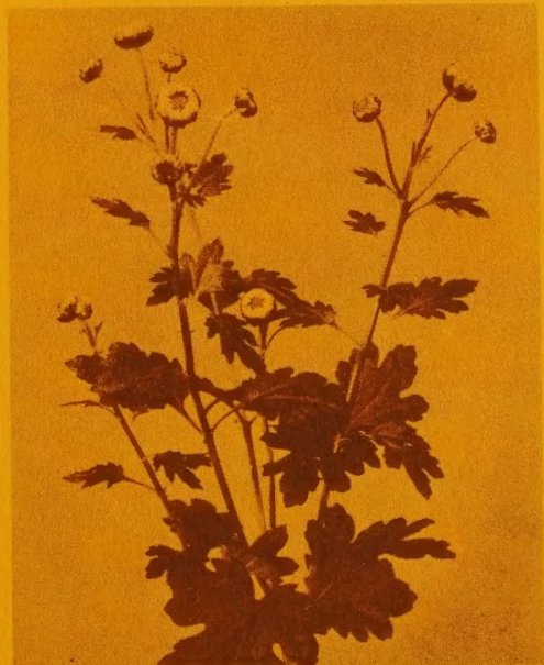
Goldsmith natural spray